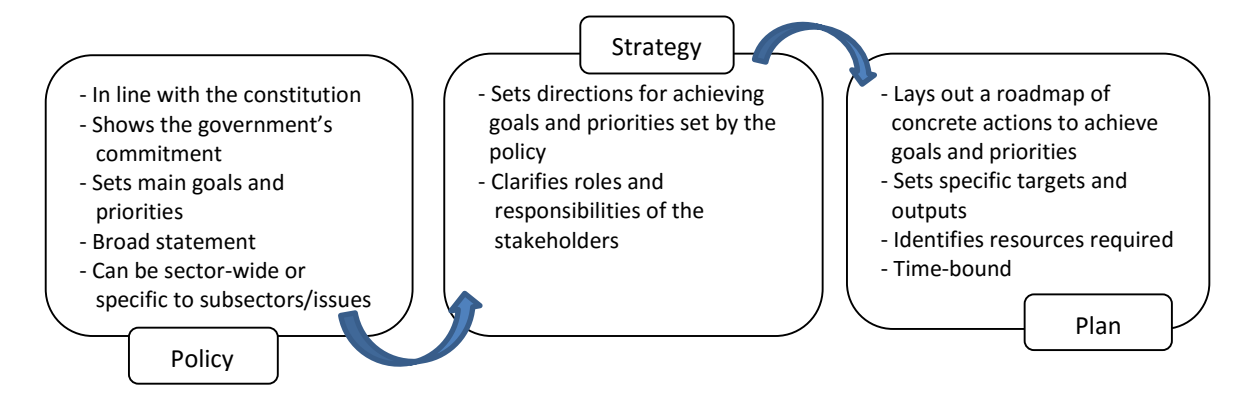
Figure 1: The relationship among policy, strategy and plan