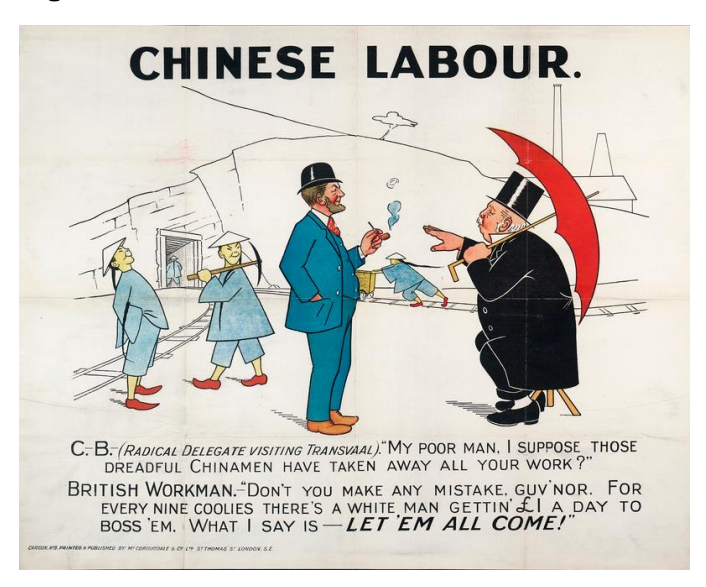
Figure 2: 'Chinese Labour.'