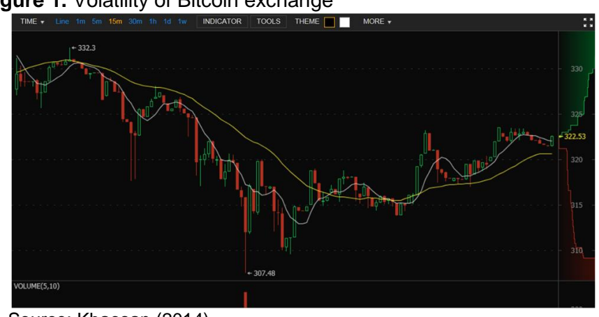
Figure 1. Volatility of Bitcoin exchange

It is therefore not uncommon (i.e. it is more the rule), that at the same time on different exchanges trades the same currency pair (for example, BCT / USD) at very different prices. From there it is very close to the idea, realized with cryptocurrency arbitrage. Taking into account the specific characteristics cryptocurrency however need to respect that arbitrage strategies will differ significantly from what we know of the standard exchanges, such as Ameritrade or Forex.