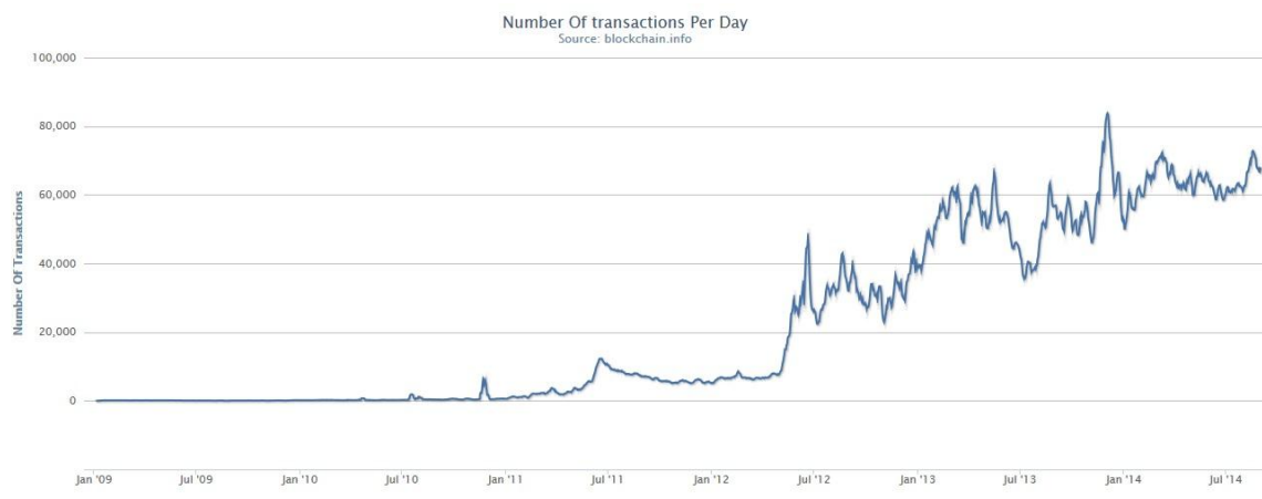
Graph 1: Number of Bitcoin transaction per day

The reason for this the demand for an alternative is distrust in the existing legal tender. This may sound strange in an era of low inflation being the main objective of