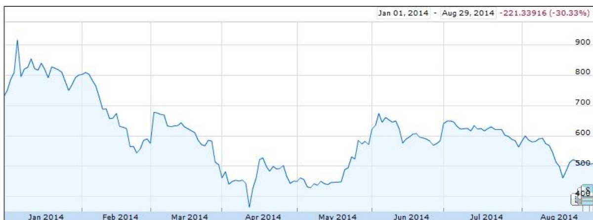
Graph 3: Price of bitcoin in 2014

The reason of very rapid end, if from the beginning it was not the intention to carry out the fraud, could be the fact that the products of the "bank" Neo & Bee were based on rising prices bitcoin. That would indicate that the whole concept was not appropriately thought over. In the period since the set-up of the "bank" until the disappearance of company representatives, bitcoin exchange rate against the dollar has been dropping steadily, as shown in the following graph.