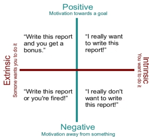
Fig.1 Four kinds of motivation

There are four kinds of motivation (Alexander Kjerulf, 2006) as illustrated in Fig 1.