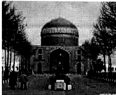
Figure 2. Mausoleum of Khajeh Rabi Mashhad

4. The Nil Gonbad Delhi (India), 1625. This was built in Nader Shah colonies and it is located inside the Humayun Gurkani mausoleum enclosure. Its internal view is similar to Khorshid Palace (Rezazadeh, 2011, 36). Considering sculptures of Khorshid Palace who came from India, the relationship between internal views of these two buildings (Nil Gonbad and Khorshid Palace) and the architectures can be understood.