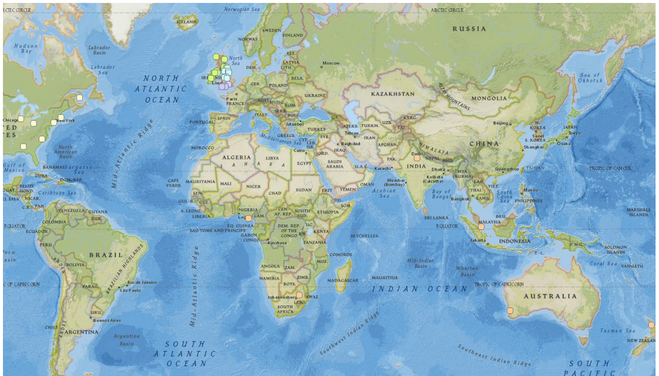
Chart 1: Distribution of English Variants Involved: Overview