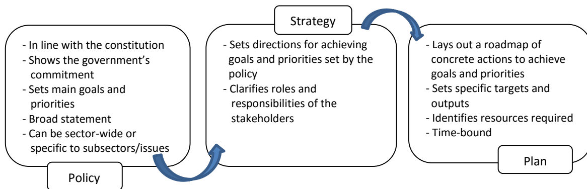
Figure 1: The relationship among policy, strategy and plan

Source: UNESCO. (2013). UNESCO Handbook on Education Policy Analysis and Programming . Bangkok, Thailand: UNESCO Bangkok, p. 6.