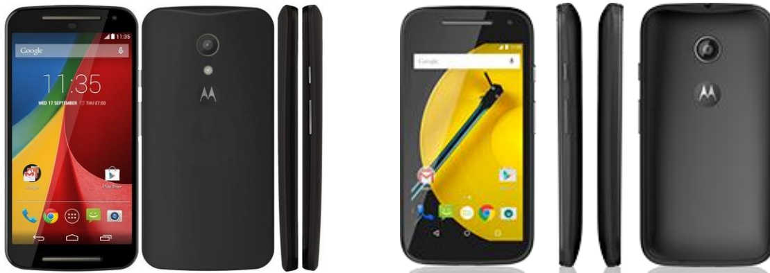
Clockwise: 1. Moto G2, Released 2014, September; 2. Moto E, Released 2014, May; 3. Moto G3, Released 2015, July.