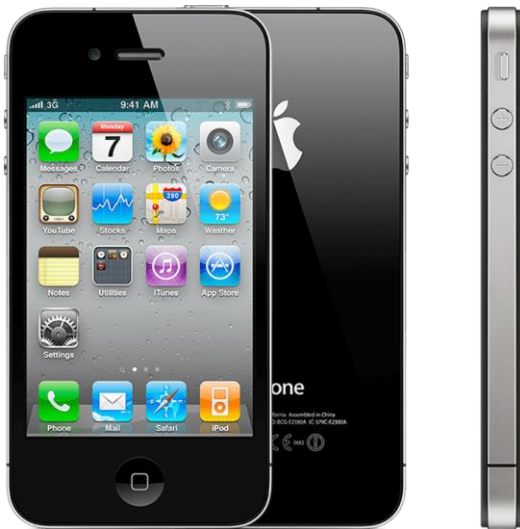
iPhone 4- Released 2010, June