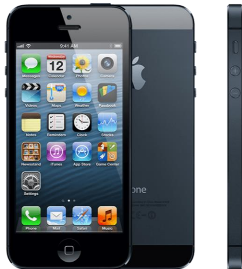
iPhone 5- Released 2012, September