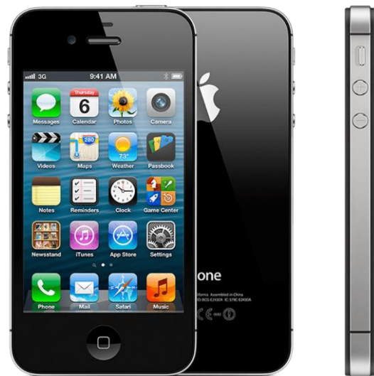
iPhone 4S- Released 2011, October