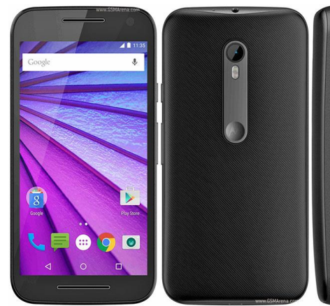
Motorola's Motto Phone Series.