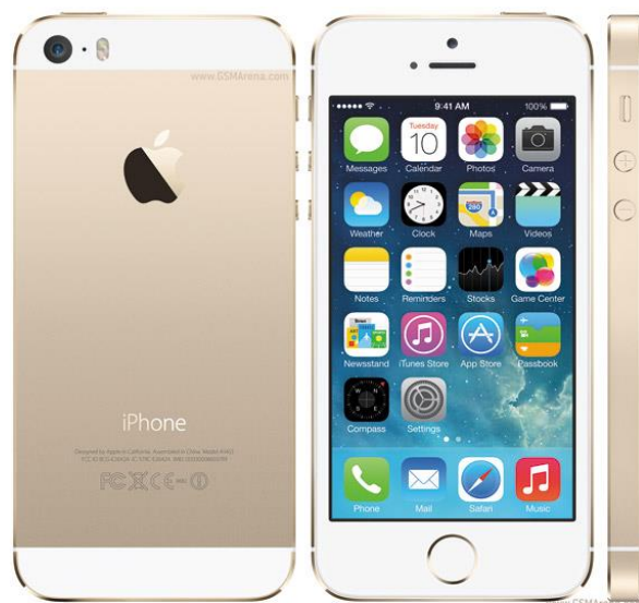
iPhone 5S- Released 2013, September

All iPhone Images. (Source : gadgets.ndtv.com ).