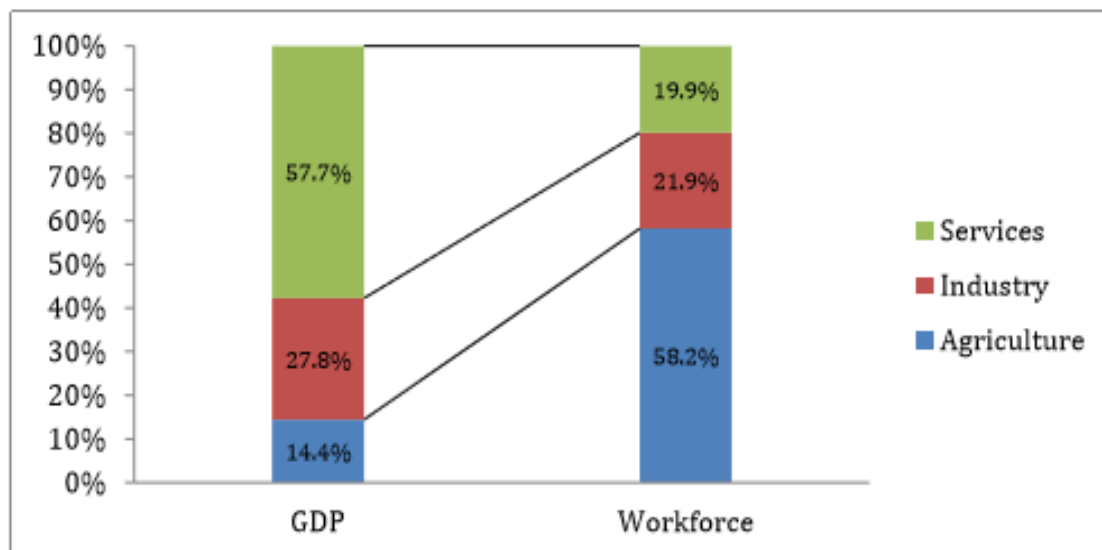
Exhibit 1: Sector-wise labour distribution ix

Skills and knowledge are the main driving forces of an economy (Planning commission, 2010), with the globalization and increasing pace of technological changes, economy encounters several challenges in terms of skill up-gradation and job creation. According to Planning commission of India and as mentioned before, only 10% of Indian labours undergoes formal training course and rest of the population lacks appropriate skills required for individual, organizational as well as economic development. Considering labour market, it is been divided into three relevant sectors as shown below: