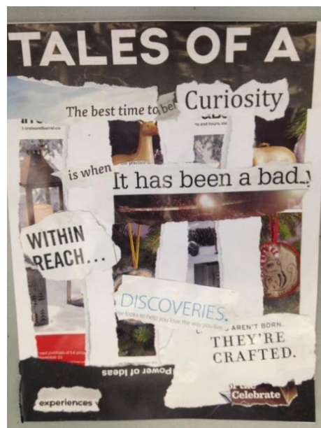
Figure 2: Example of visual collage

The researchers then encouraged participants to discuss the elements of their collage that were most sacred to them as practitioners, as well as their thoughts about what elements of their own praxis they see reflected in or excluded from the dominant discourses surrounding identity in Child in Youth Care. Through discussion, the cohort developed a loose definition of a CYC identity archetype and actively compared their expressions of praxis with that construct. The session concluded with an open discussion regarding participants' collages, the process of collage creation, and the reciprocal impact of professional identity on praxis.